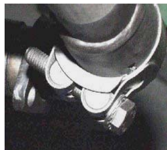
Fig 3 Plated steel clamp M8 bolt (13mm AF)