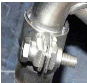
Fig 2 Stainless steel clamp M10 bolt (17mm AF)